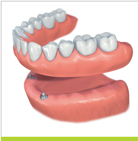
Removable implant-retained dentures.