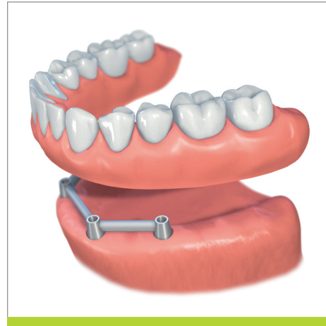
Removable implant bar-supported dentures.